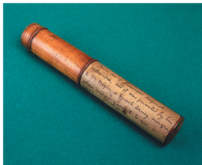
Fig. 3. R.-Th. H. Laennec and his original stethoscope (from Science Museum, London)