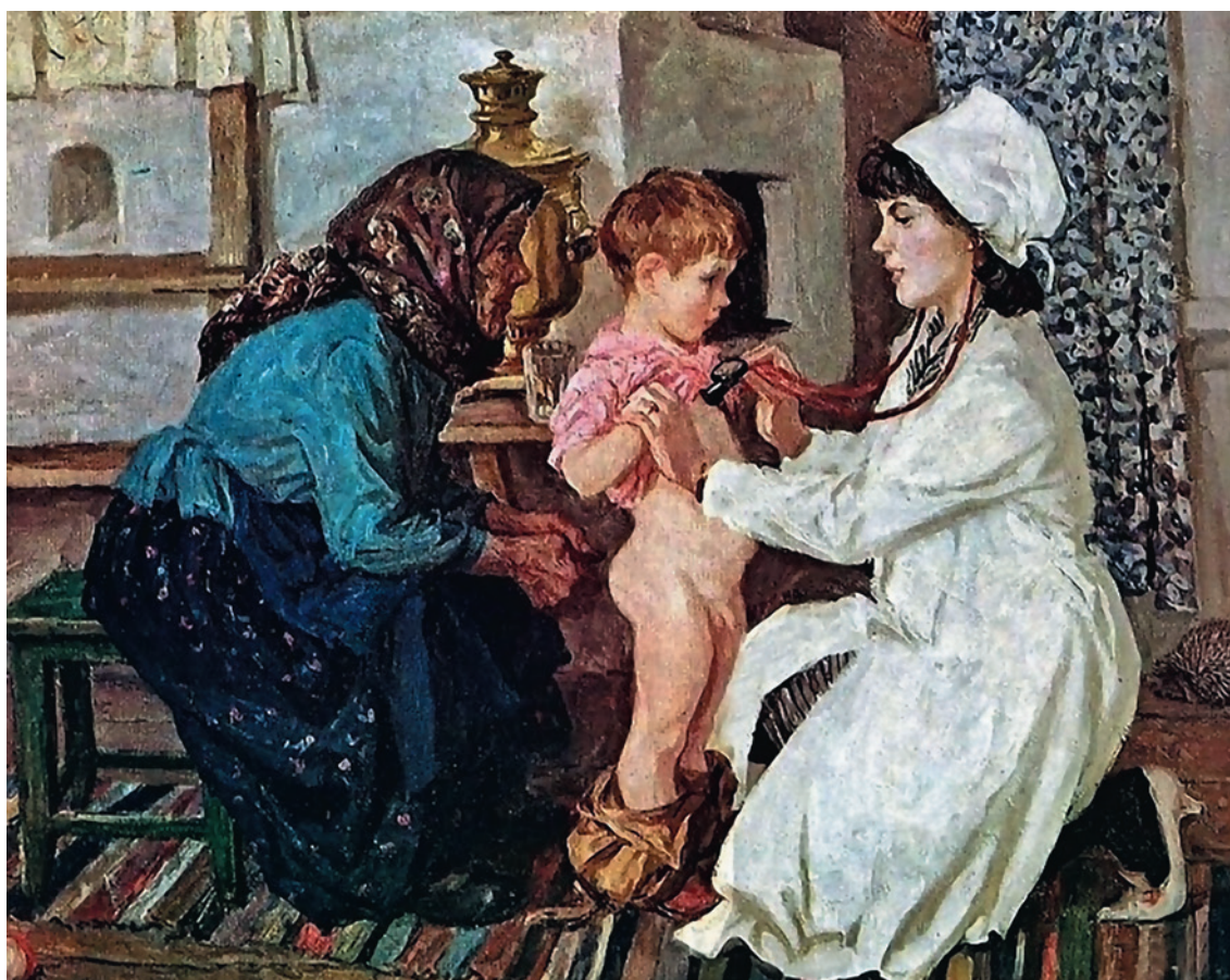
Fig. 6. N.A. Plastov (1930–2000). "Doctor" (Oil, canvas, 1966. Achinsk Museum and Exhibition Centre, Achinsk)

Nil Feodorovich Filatov (2 June 1847, Mikhailovka near Penza, Russian Empire — 8 February 1902, Moscow, Russian Empire).