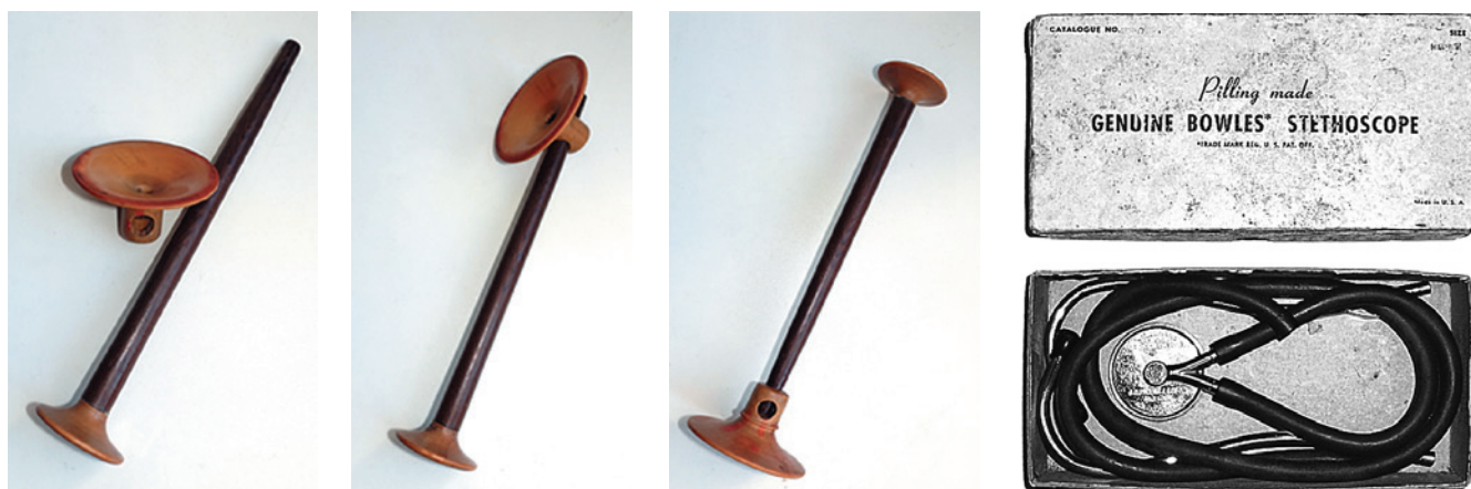
Fig. 5. Two variants of stethoscope construction. Left: Traube's monaural stiff model of stethoscope produced in mid-XX century (box-wood). Left to right: In disassembled, "marsh" and functional states (from the private collection of Y.I. Stroev). Right: Bowles' binaural flexible model (from Museo de Medicina Infanta Margarita, Madrid. Open Gallery)