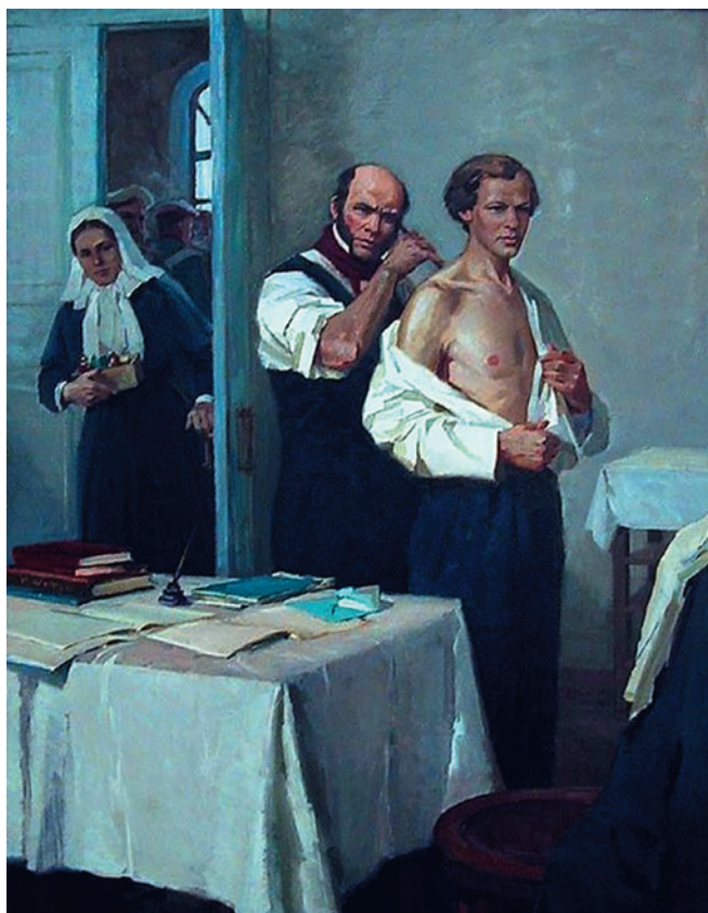
Fig. 1. I.A. Tikhov (1927–1982). N.I. Pirogov examines D.I. Mendeleev (Oil, canvas. Vinnitsa, Museum-estate of N.I. Pirogov)