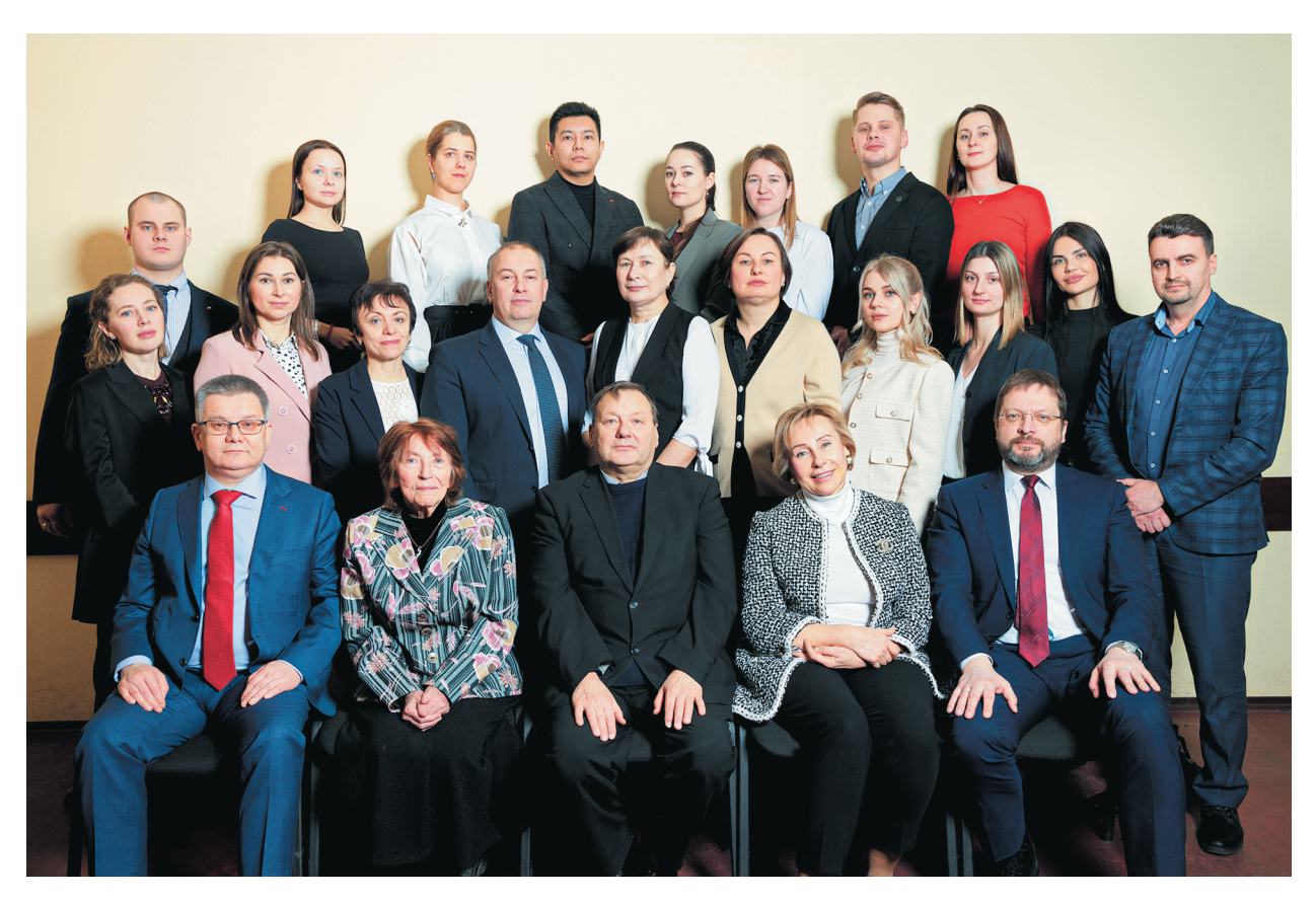
Fig. 4. The staff of the Department of Public Health and Healthcare with the course of Economics and Health Management of the First St. Petersburg State Medical University named after Academician I.P. Pavlov (the photo made in 2023)