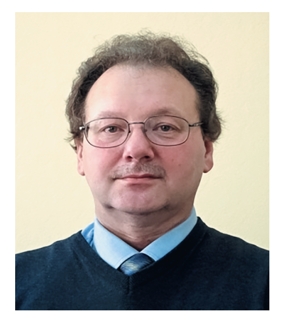
Fig. 3. Nikolay I. Vishnyakov